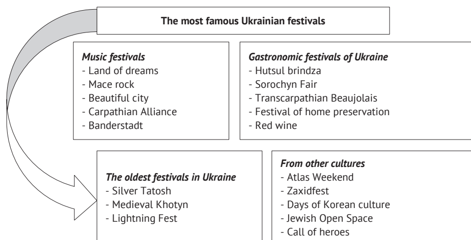
Figure 3. The most famous Ukrainian festivals

The combination of elements of intangible cultural heritage with the festival movement also has a positive effect on the development of the regional tourist market, in particular, in Figure 3 presents the most famous Ukrainian festivals. So, for example, there are many people who want to visit the “Sorochyn Fair” (Poltava region) or “Malanka Fest” (Chernivetsk region), and therefore, from one point of view, this is an increase in the interest of tourists, and from the other, it is a positive influence on the development of related industries with tourist.