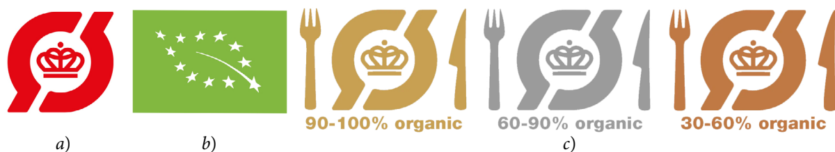
Figure 1. Organic food labels:

a – organic state-authorized label certifying that the product has been controlled by the Danish food authorities; b – Mandatory label on all organic products sold in the EU; c – Danish certification system for large-scale kitchens (restaurants, school kitchens, catering etc.) indicating the percentage of organic raw material used in the kitchen