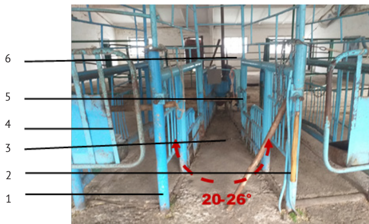
Figure 1. General view of the DDU-2M milking unit for milking mares

In the summer, dairy mares are kept on walking and feeding grounds, after three milkings – on a pasture with foals, and at night until 6 a.m. – also on grounds, that is, mares and foals are together for about 17.5 hours a day and separately, respectively – 6.5 hours. In the winter, mares are kept on walking and feeding grounds (during the day), and at night in the capital premises – in sections of 10 heads at the rate of 6.5-7 m 2 per head (Marchenko et al. , 2018). Three milkings are used on the farm, the first of which takes place at 8 in the morning, the next at 10 and 12, respectively, i.e. the time interval until the first milking, and between the following is two hours, after which foals are brought to the mares, which are deliberately kept until 6 in the morning, i.e. mares are without foals for 6.5 hours. The milking plant consists of two milking machines (Fig. 1), which are a welded construction of metal pipes and are located at an angle of 20-26°C relative to each other, between which the workplace of the machine milking operator is located.